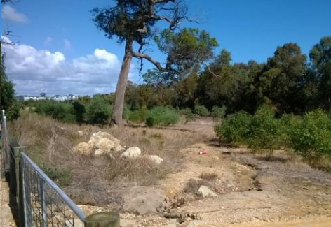
Table 1: Annual photo monitoring points Tamworth Hill Swamp Revegetation