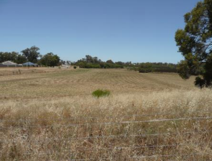
Table 1: Annual photo monitoring points Tamworth Hill Swamp Revegetation