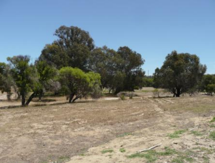
Table 1: Annual photo monitoring points Tamworth Hill Swamp Revegetation