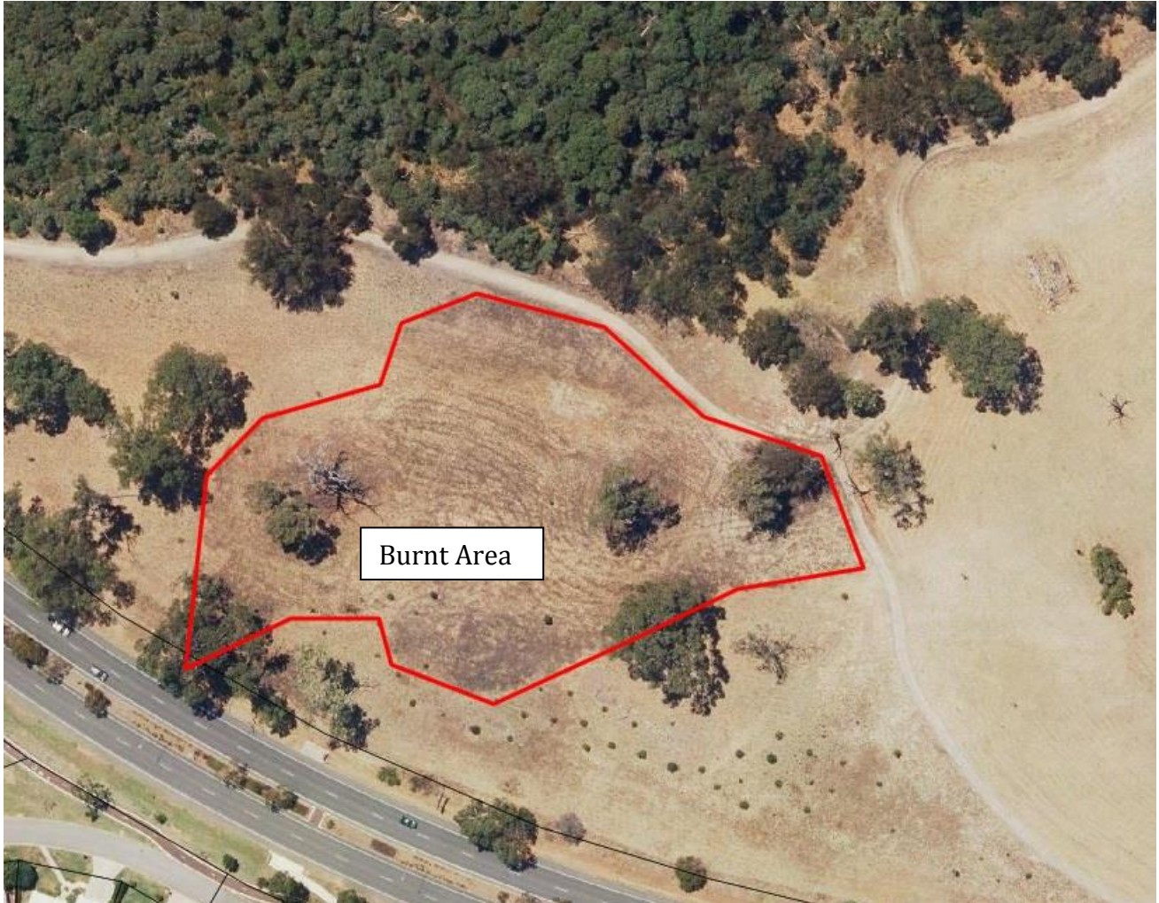
Figure 2: Burnt area – 800m 2

In winter 2015, the City revegetated 10.4 hectares with 30,000 plants (Areas 1 and 2 as indicated in blue). A further seven hectares were revegetated with 27,000 plants in winter 2016 (Areas 3 and 4 indicated in yellow on Figure 1). During winter 2017, 15,000 plants are scheduled to be planted throughout three hectares of degraded area (indicated in Figure 1 by red). The 2017 revegetation will include new revegetation zones (Area 6 and 7), infill planting throughout existing zones and replacement of plants lost during a fire in late 2016 that burnt through an estimated 800m 2 area near Safety Bay Road (Area 5).