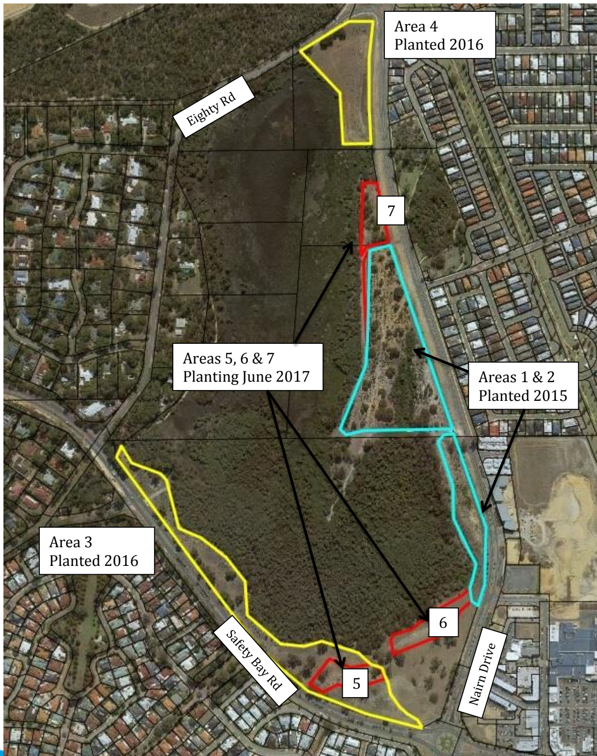
Figure 1: Revegetation Zones – Tamworth Swamp

Figure 1 below illustrates areas of revegetation at Tamworth Hill Swamp. Species used in revegetation are plants known to be primary feeding plants for Black Cockatoos or recommended in the THSRRP and are listed in Table 2.