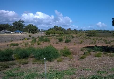
Table 1: Annual photo monitoring points Tamworth Hill Swamp Revegetation