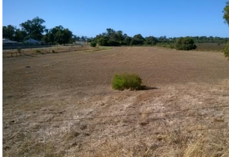
Table 1: Annual photo monitoring points Tamworth Hill Swamp Revegetation