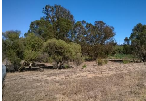
Table 1: Annual photo monitoring points Tamworth Hill Swamp Revegetation