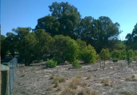
Table 1: Annual photo monitoring points Tamworth Hill Swamp Revegetation