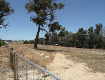
Table 1: Annual photo monitoring points Tamworth Hill Swamp Revegetation