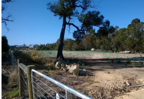
Table 1: Annual photo monitoring points Tamworth Hill Swamp Revegetation